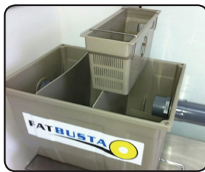
"Includes solids basket"