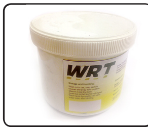
"Use solution 250 to help remove grease"