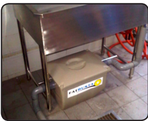
"Fits under most domestic sinks"